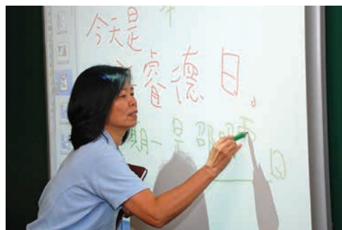
UNIVERSITY OF NORTH GEORGIA

The Language Flagship encourages all domestic Flagship programs to collaborate with ROTC detachments on their campuses to make these kinds of opportunities available to qualified ROTC students.