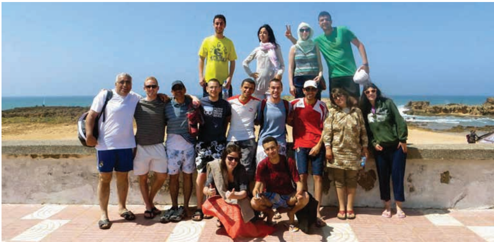
Arabic Flagship Capstone students and instructors visit Oualidia, a Moroccan coastal village.

Arabic Flagship students completing their capstone year witness international cooperation first hand, daily, as part of their overseas experience. In July 2013, the Arabic Flagship Overseas Center managed by American Councils for International Education was relocated from Alexandria, Egypt, to the Arab-American Language Institute in Morocco (AALIM) because of safety concerns related to political insecurity. Located in Meknes, one of the ancient Moroccan capitals, AALIM already had ties to The Language Flagship as the site of the Summer Arabic Overseas Flagship Program.