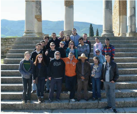
Arabic Flagship Overseas Capstone students visit the Roman ruins of Volubilis, an archeological site about 1 hour from Meknes. The partly excavated city once demarcated the southern fringe of the Roman Empire and now is a United Nations Educational, Scientific and Cultural Organization (UNESCO) World Heritage Site.