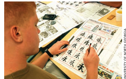
An ROTC Flagship cadet practices writing Chinese characters during the Summer Language Institute at UNG.